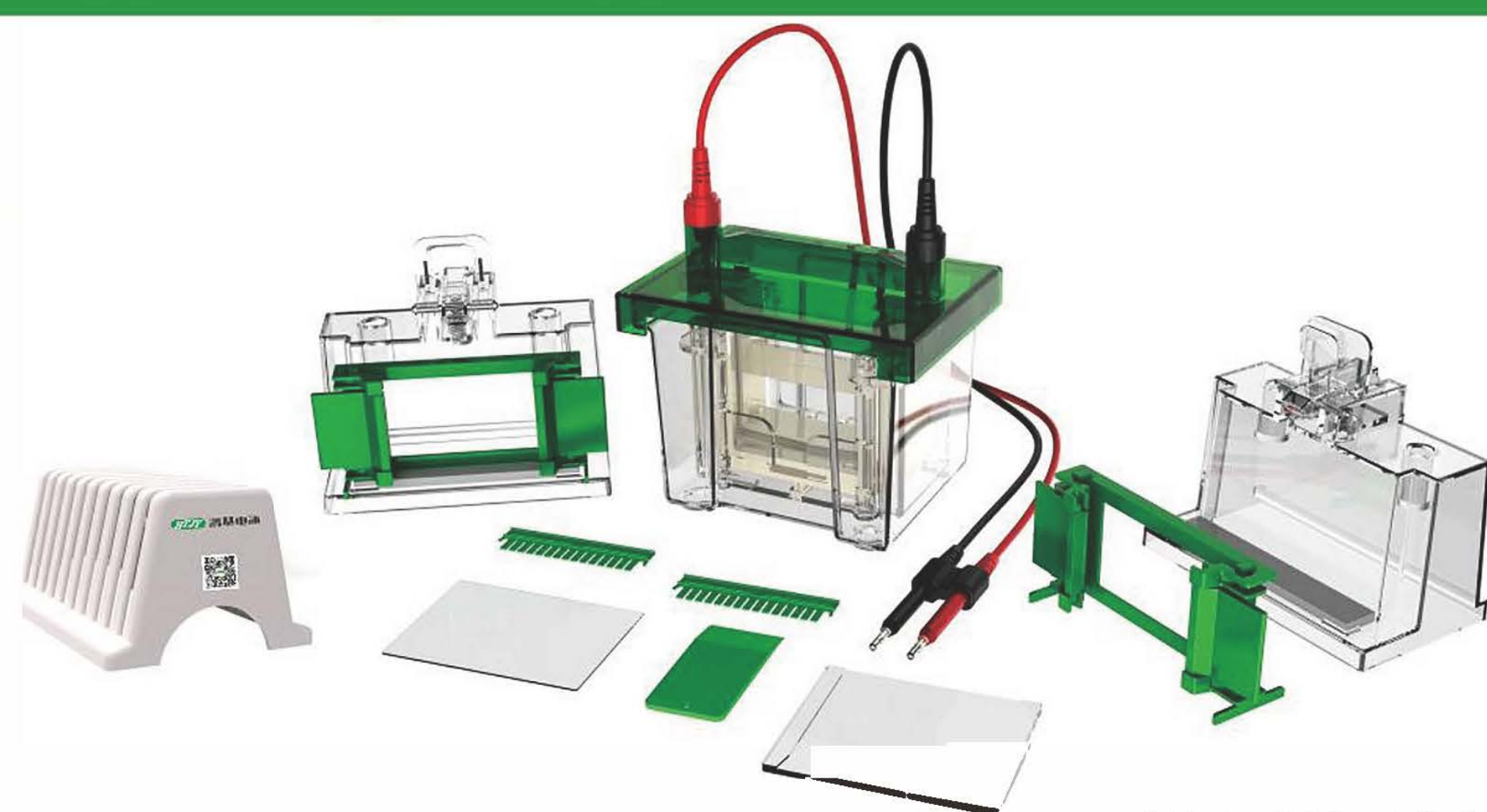
HT-Mini01 Vertical electrophoresis tank (double plate)